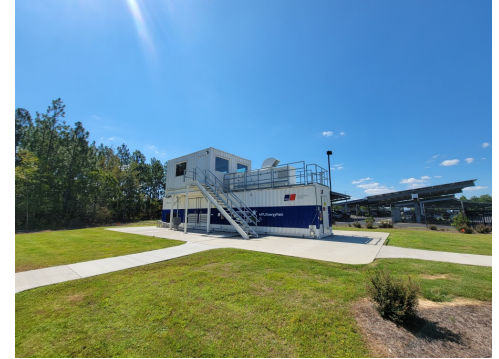
Rolls Royce Power Systems Microgrid